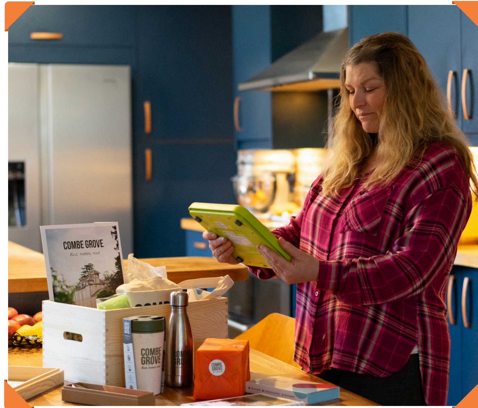
Client opening her welcome box.

You will also be part of a small cohort of 20 like-minded individuals, sharing your journey through live webinars and group sessions. This creates a supportive, close knit community where you can learn, reflect and grow together.