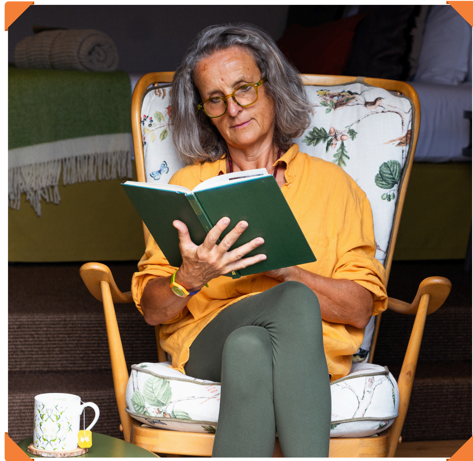
A Client reading peacefully in the refurbished Ercol chair with a cup of Pukka tea.

Clients have the opportunity to return to Combe Grove for a Returner's Stay to further develop their knowledge of metabolic health and to review the progress already made.