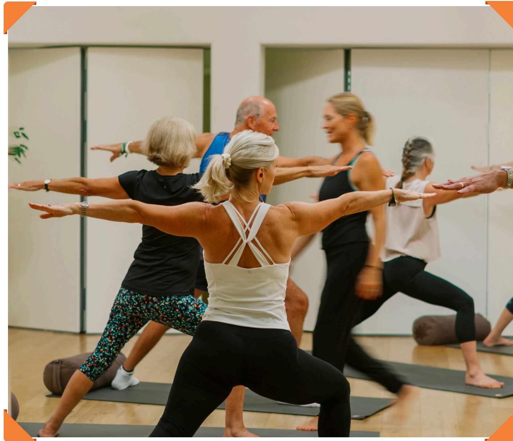
Yoga class in the Oak Room

If you are looking for an experience to celebrate an important life event including birthdays, anniversaries or hen parties, a wellness package at Combe Grove allows you to enjoy life's best moments with loved ones, whilst feeling your best.