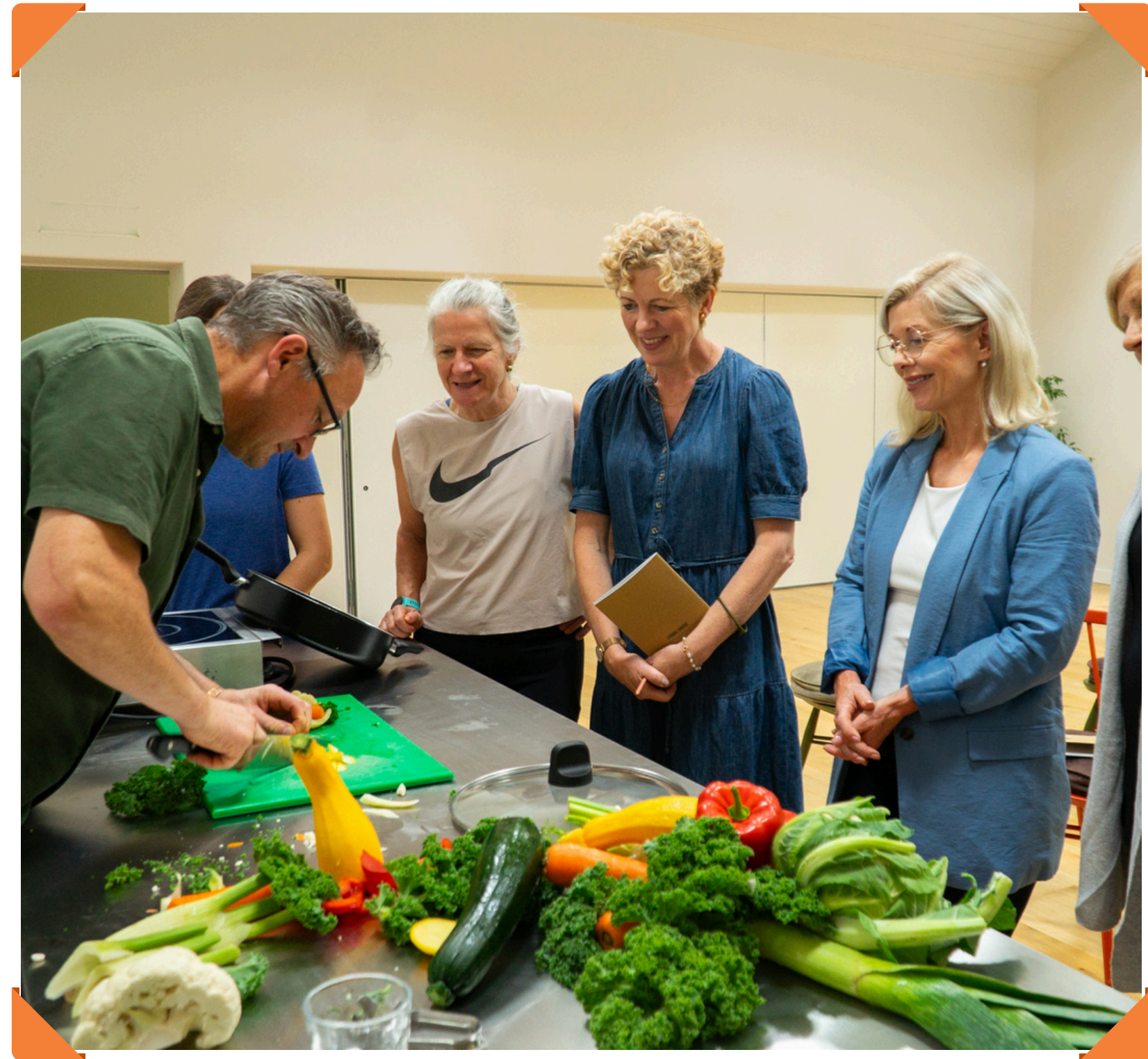
Cooking demonstration on the Health Reset Day.

Participants have the opportunity to purchase an overnight stay before and/or after the Reset Day, allowing those further away to benefit from a restful night's sleep before heading home. Additionally participants can book a rejuvenating treatment or massage therapy to enhance their experience. Both of these options can be booked with our team prior to your visit.