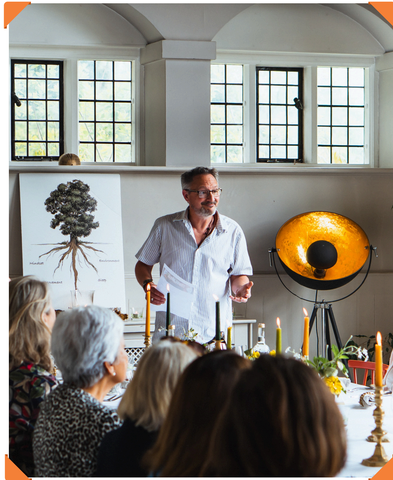
Nutritionist sharing a valuable nutrition tip during a Health Reset Day brunch.

A 12 week online programme that supports you to make transformational change to your metabolic health from the comfort of home, with guidance from your personal Nutritionist.