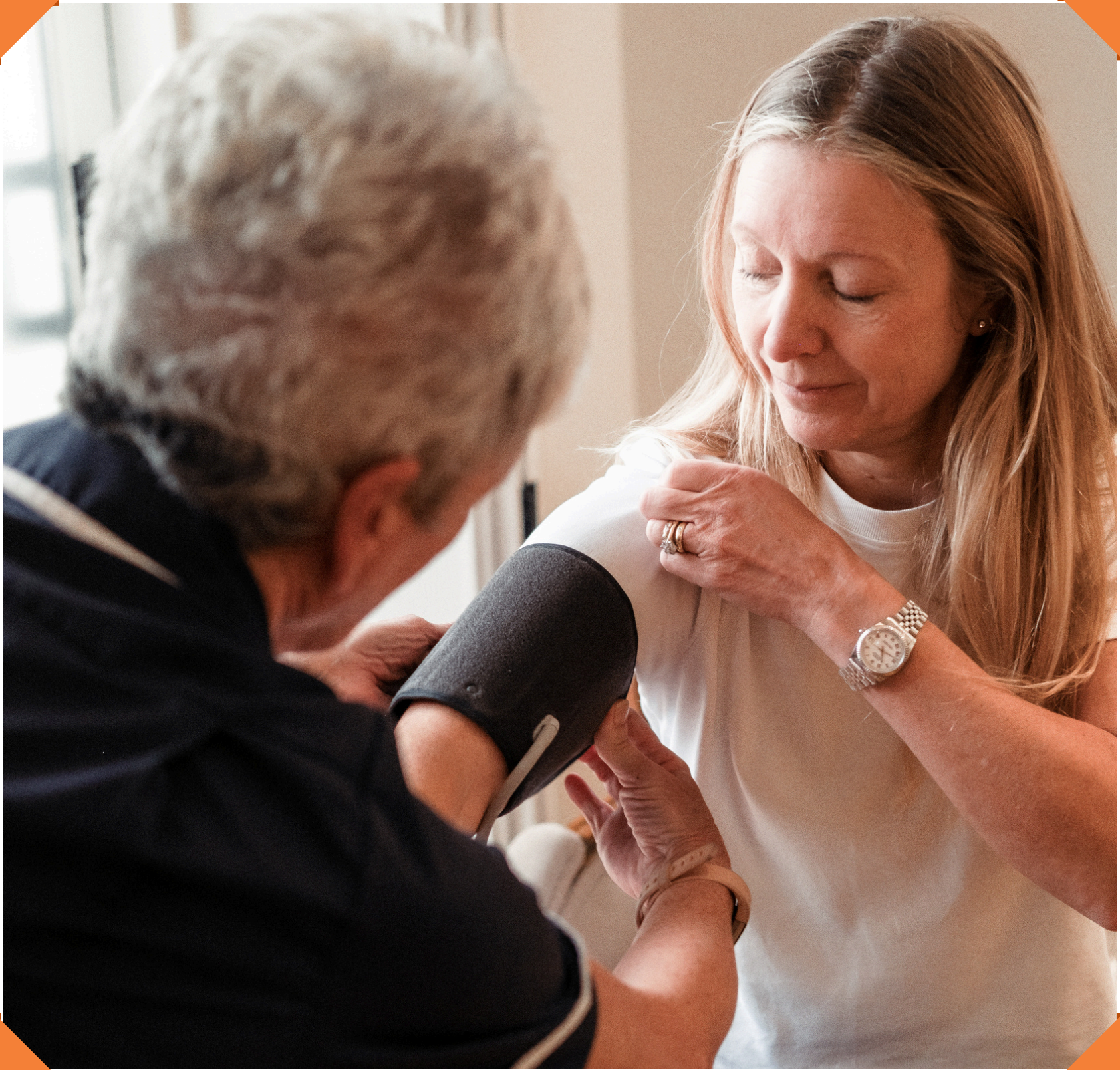
A Client having their blood pressure taken during the health assessment.

Triglycerides are a type of fat in our blood and an essential energy source in the body. If our levels become too high, this can increase our risk of developing cardiovascular disease and other metabolic diseases.