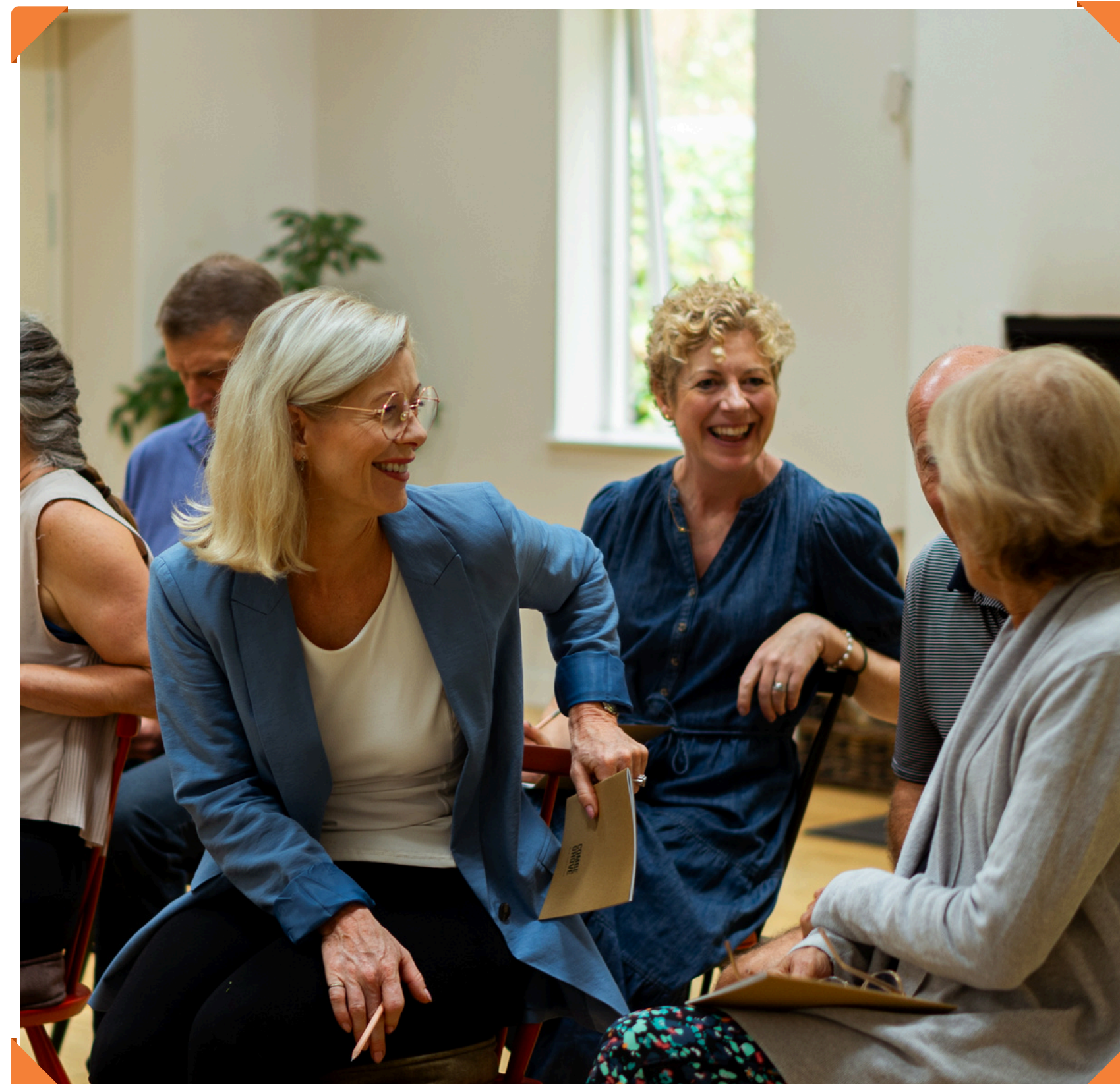
Clients converse during a Metabolic Health Workshop.

Returning allows you to reconnect with old friends, strengthen existing bonds and meet new like minded individuals who share your commitment to health. The Returner's Retreat fosters a strong sense of community, where clients support and motivate each other, making the journey even more rewarding.