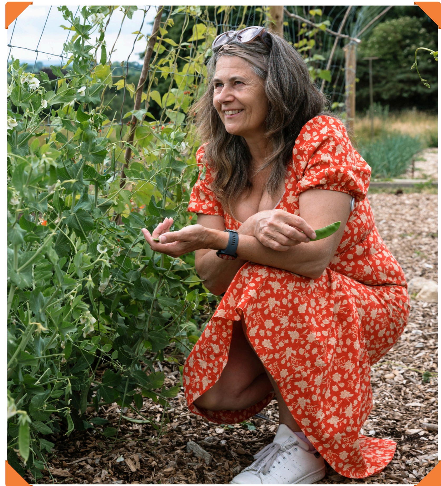
A Client exploring the Kitchen Garden.