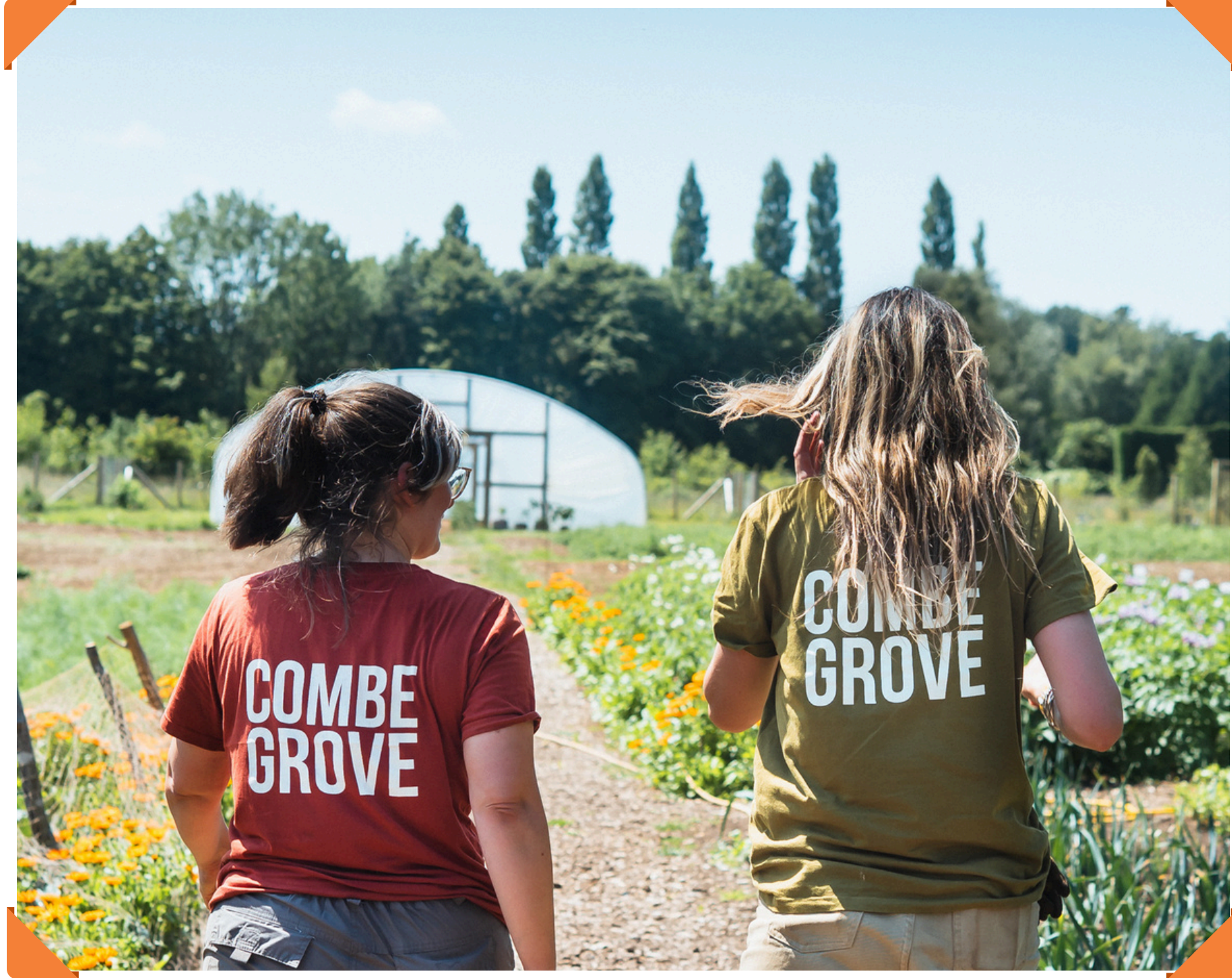
Horticulture Apprentices in the Kitchen Garden

Sustainability is woven into everything we do. Our land is managed using environmentally responsible permaculture methods to encourage biodiversity and we are nurturing the soil for future generations.