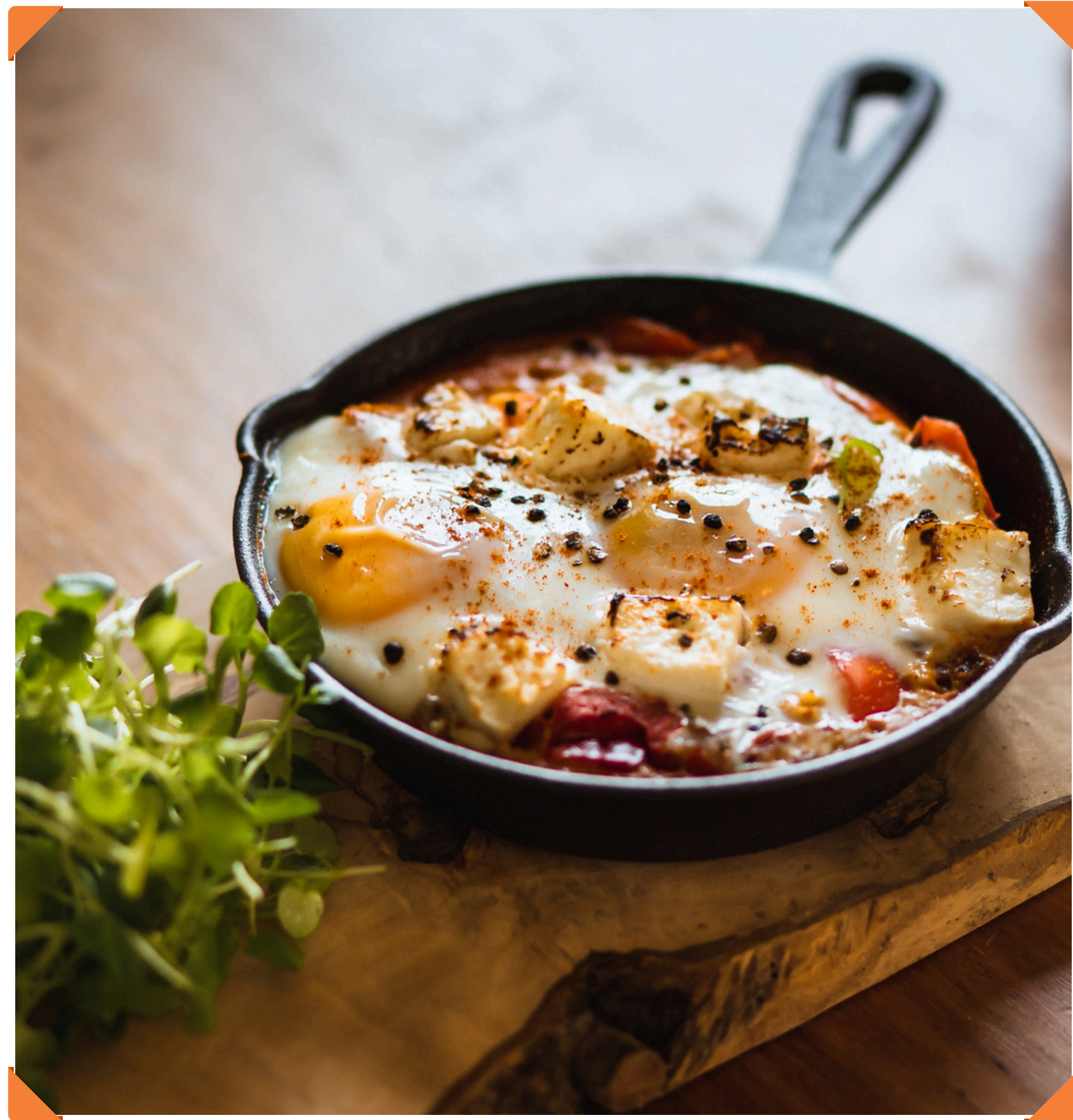
Baked Eggs dish served in the Map Room.

Consultations can be conducted either in person or online, depending on preference and are accessed via our secure client portal on Practice Better.