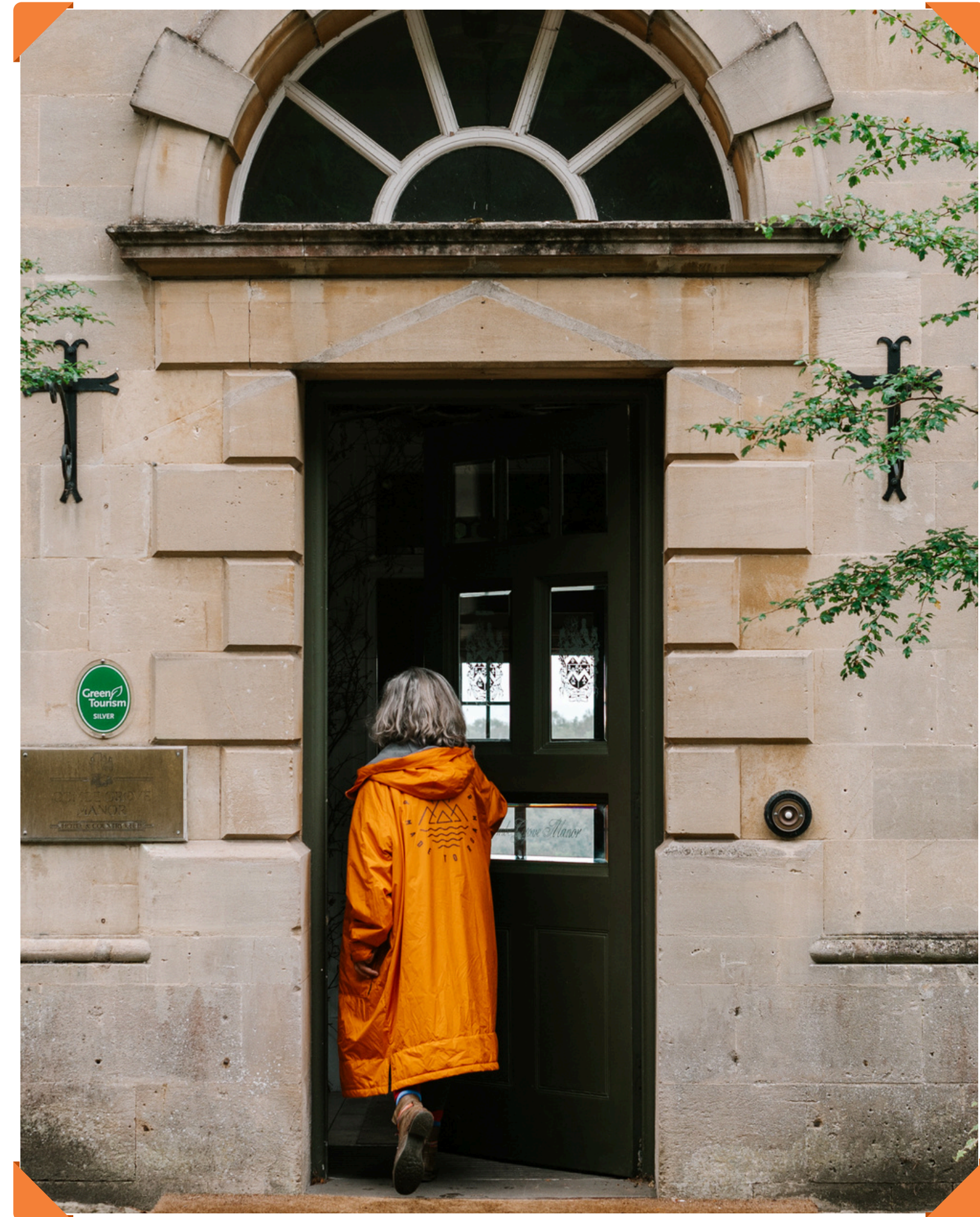
A Client arriving at the Main House.