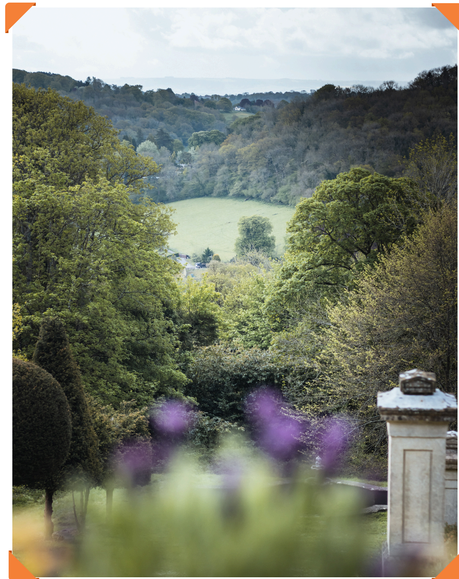
South facing view across the Valley.